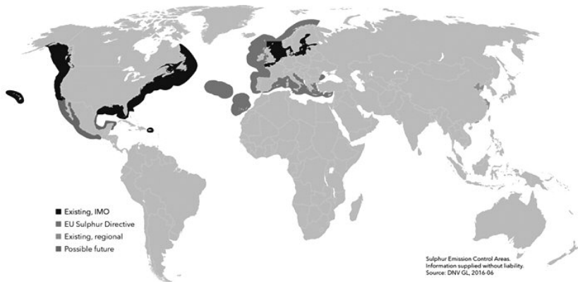
Figure 1. Existing and Possible Future Sulfur Emission Control Areas

Note: ECAs, as defined by MARPOL Annex VI, the scope of the EU Sulphur Directive, and other regionally controlled areas.