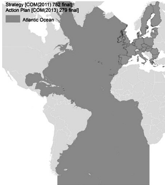
Figure 2. EU Maritime Strategy for the Atlantic Area, Scope of Intervention