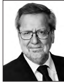
Per Stig Møller

Per Stig Møller has been a Conservative People's Party Member of the Danish National Parliament from 1984 to 2015. In 1990 he was the Minister of Environment, Foreign Minister in 2001, and the Minister of Culture and Church until 2011. Before his political campaign he was a radio talkshow host on Danmarks Radio and has taught at universities in both Copenhagen and France.