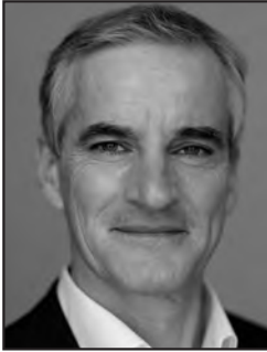
Jonas Gahr Støre

Jonas Gahr Støre is the leader of the Norwegian Labour Party. He served as Minister of Foreign Affairs 2005–2012 and as Minister of Health and Care Services 2012–2013. Mr. Støre has held various positions at the Prime Minister's Office from 1989 to 1997, including as Special Advisor to Prime Minister Gro Harlem Brundtland, for whom he also served as Chief of Staff (1998–2000) during her time as Director-General of the WHO. Among other positions, Mr. Støre served as Secretary General of the Norwegian Red Cross. He has a degree in Political Science from Institut d'Études Politiques de Paris.